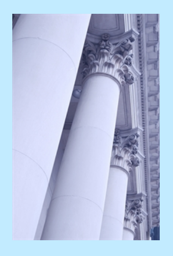
Typically, the executor is a spouse or a close family member, but you may want to name a professional executor, such as a bank or attorney.