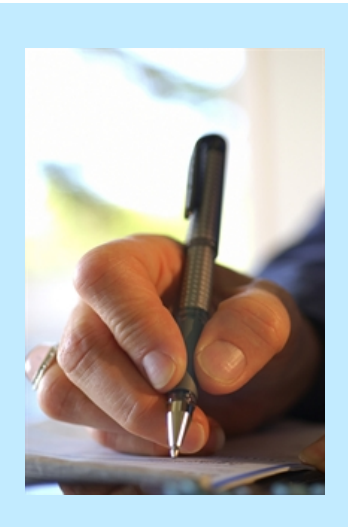
The elective share (sometimes called the widow's election, forced election, or "taking against the will") is a statutory right of a surviving spouse to receive a specified share of the decedent's estate instead of accepting the provisions made for the spouse in the decedent's will.

A family settlement is a legally binding agreement (or contract) made among your heirs and/or beneficiaries regarding the distribution of your estate.